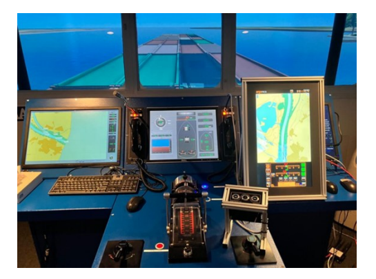
Figure 1: One of the bridge simulators used in the project. The interface of the trackpilot of Argonics is right on the picture.

3. Are there operational boundaries, such as time and distance between vessels, traffic density or traffic complexity, to utilize any found advantages of IS?