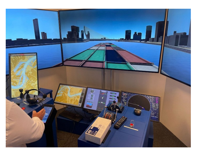
Figure 2: Bridge simulator at MARIN. The trackpilot of Shipping Technology as well as an alternative visualization are on the left.

Secondly, the trackpilot interfaces had to be adapted to show the intention data of the ships in the environment. All three suppliers used their own design resulting in different ways presenting the information on an Electronic Navigational